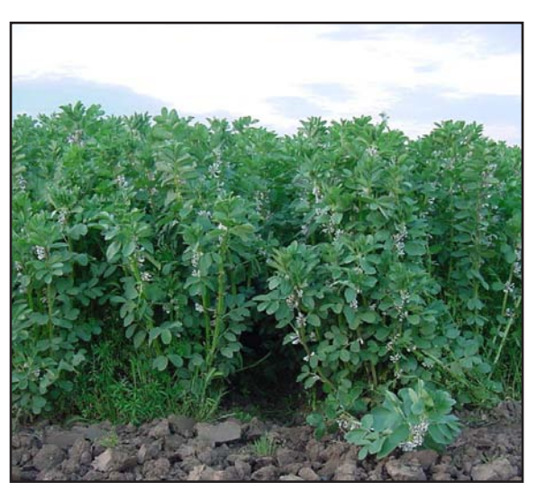
Figure 2. Six-foot-tall fava bean cover crop, Fong Farms, Woodland, California 2006.

Funded by a grant from Western Sustainable Agriculture Research and Education (WSARE). Sustainable Agriculture Research & Education