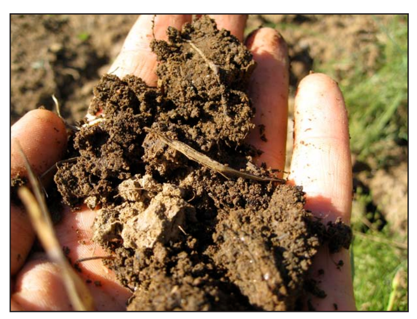
Figure 7. Organic management builds a soil full of aggregates and organic matter.