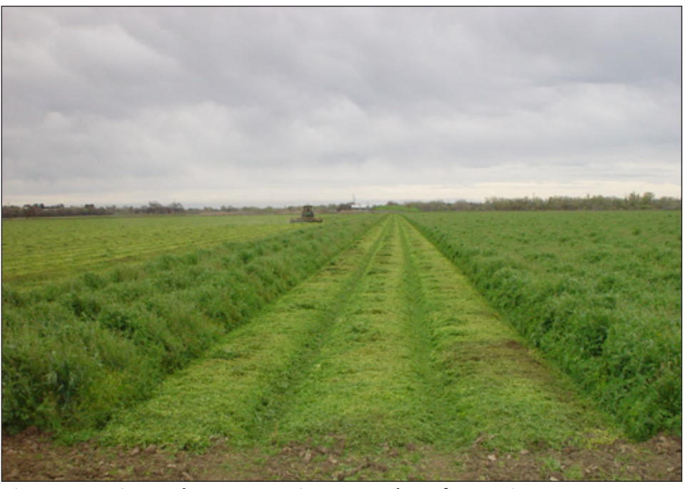
Figure 3. Mowing vetch cover crop prior to transplant of processing tomatoes.