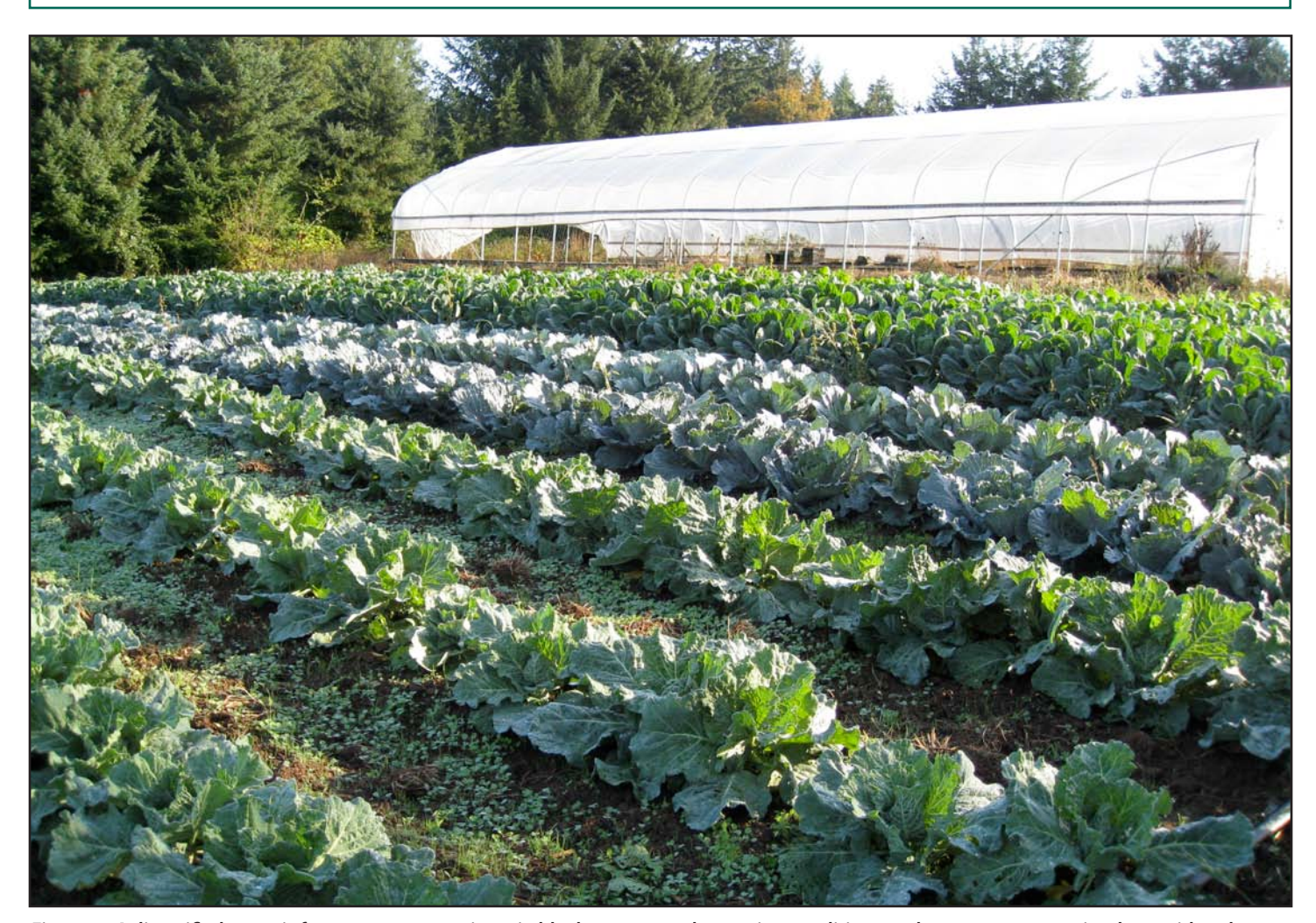
Figure 8. A diversified organic farm manages nutrients in blocks to ensure the varying conditions and crops are appropriately considered.

can likely be used to meet many of the requirements related to soil fertility. Additionally, this information can be used to help organic growers track the trajectory of the SOM because organic rules state that the grower must maintain or improve SOM content.