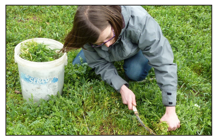
Figure 5. Assessing the biomass of a cover crop.

Potassium is available as a positive ion, or cation, and soils with a high cation exchange capacity (CEC) will generally have more capacity to store K. Most soils with high clay content, high organic matter levels (>3%), or both will